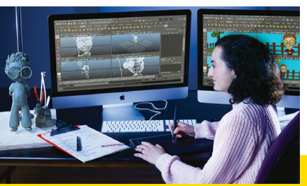
3D ANIMATION & VFX

Photographers use images to tell compelling visual stories. At NYFA, aspiring photographers can learn the technical and creative elements of the visual art of photography through practical training and hands-on projects. Throughout the programs, students develop skills in digital photography, as well as web and business industry practices while establishing their own unique style. In our photography programs, students gain advanced knowledge and techniques in shooting, lighting, printing, editing, graphic design, and video production, as well as a wide range of photographic disciplines.