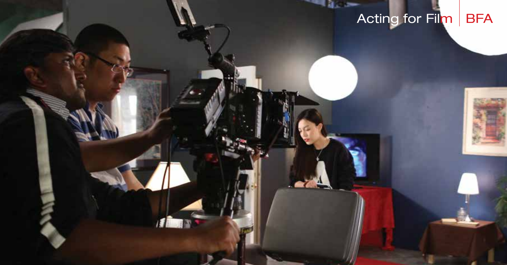
A New York Film Academy BFA Acting For Film student performs for the camera on a set in Los Angeles.